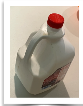
Opaque jug - not good!

The white jug blocks the light - the translucent jug allows the sunlight to warm the soil and let the seeds know which direction to grow in.