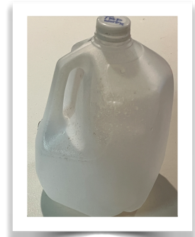
Translucent jug - good!

2) Wash out the jugs - you do not need to sanitize them, just rinse them out.