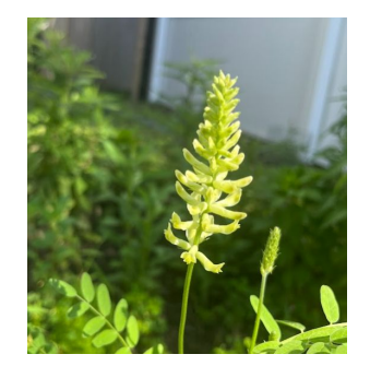
Canada milk vetch