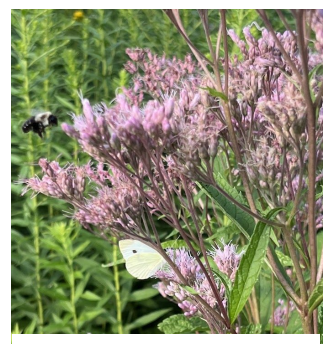
Joe Pye weeds